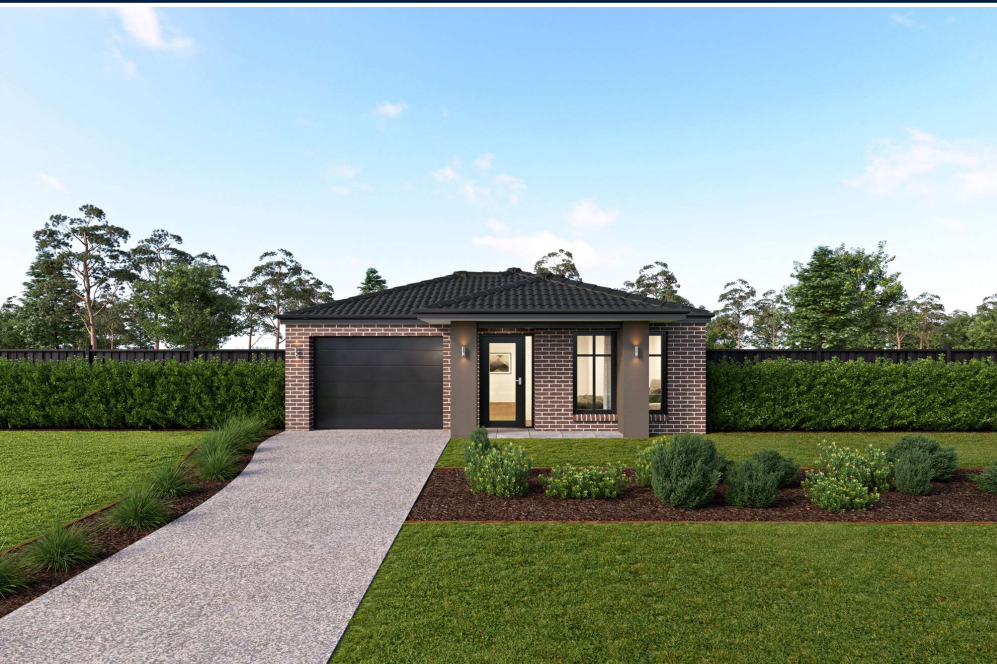
Pricing excludes Landscaping, Fencing, Concrete paver, Decking, Planter box